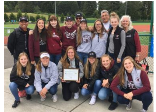
State Academic champs: Varsity softball.