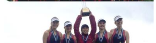
HNA crew athletes with Northwest Regional Regatta trophies in Vancouver on May 22.