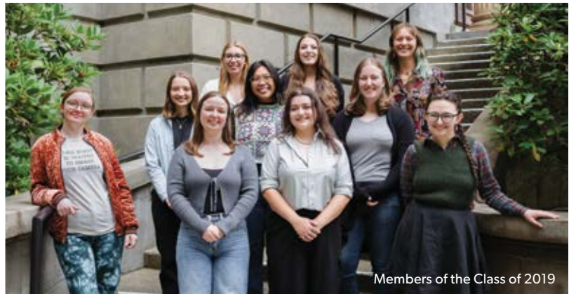
Members of the Class of 2019