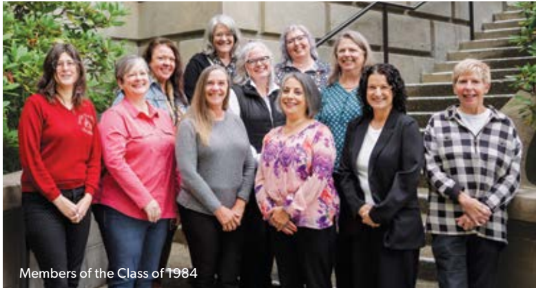
Members of the Class of 1984

In September, the Alumnae Office was thrilled to welcome back alumnae from many decades to celebrate their class reunion. In recent times, the Alumnae Reunion Celebration has been held for classes celebrating a milestone reunion between five and 45 years. This year, the Classes of '79, '84, '89, '94, '99, '04, '09, '14, and '19 gathered for a brief program that included a stunning performance by HNA's Vocal Ensemble, building tours, refreshments, and social time. Thank you to all who came out to celebrate your class and your school!