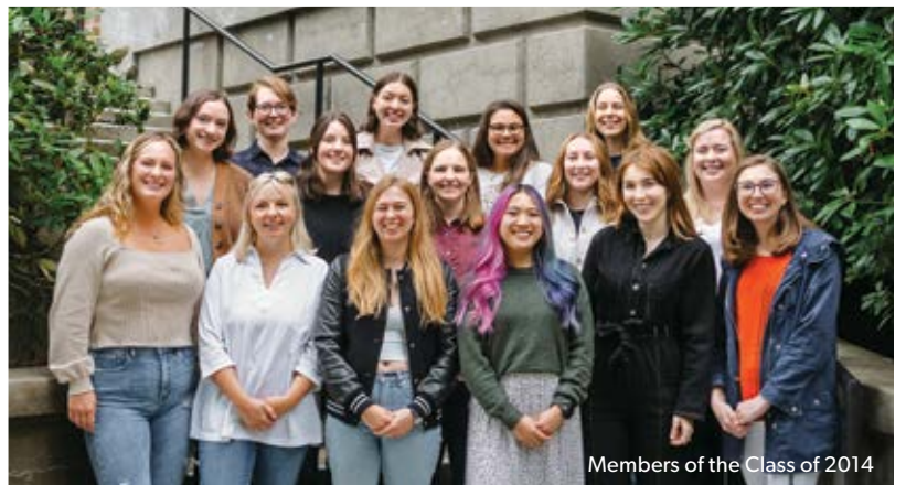
Members of the Class of 2014