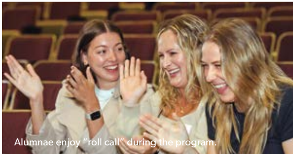
Alumnae enjoy "roll call" during the program.