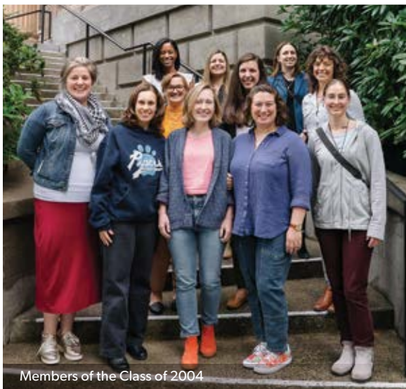
Members of the Class of 2004