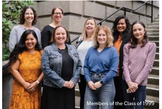
Members of the Class of 1999